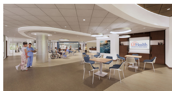
Renderings show exterior and interior views for the new hospital tower.